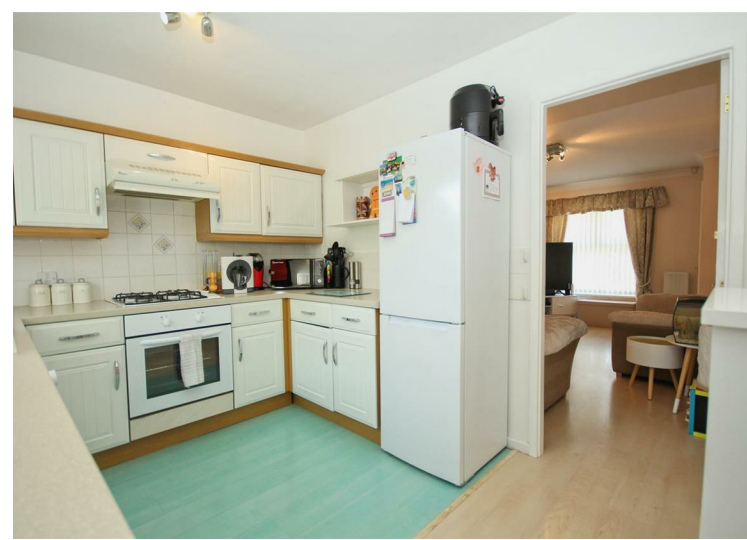
2 Bishop Kempthorne Close, Hesse HU13 9LY Offers in the region of £160,000